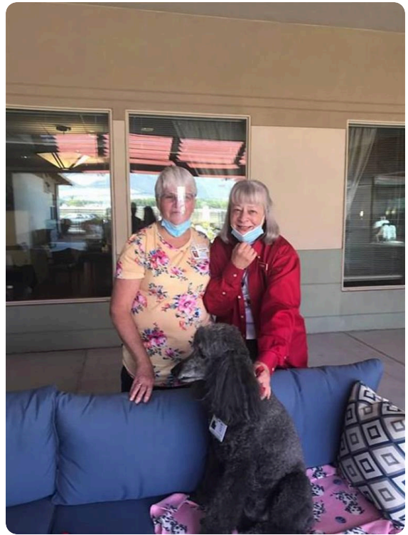
Patio Visits 2021